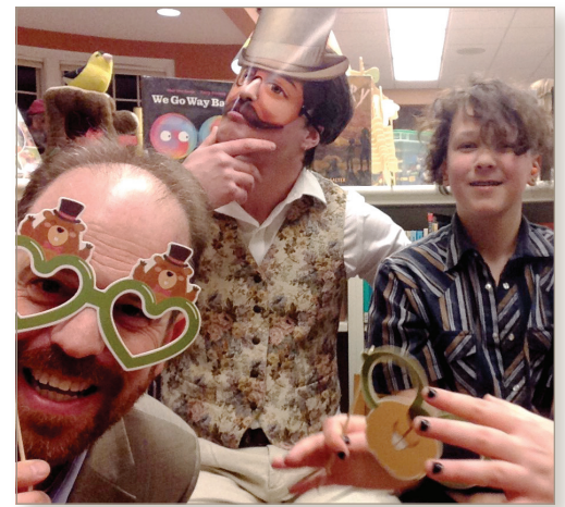
Groundhog Day revelers clown around in BHPL's photo booth.

Back in February, we were dreaming of such days when we hosted a new family-friendly fundraiser, the Groundhog Day Ball. It was