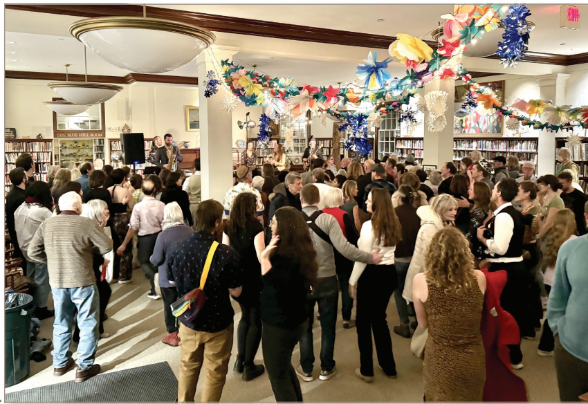
Soul Benders entertain at the Groundhog Day Ball in February.